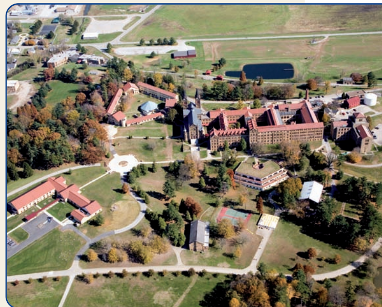
⊗ An Aerial View of Saint Meinrad Archabbey.