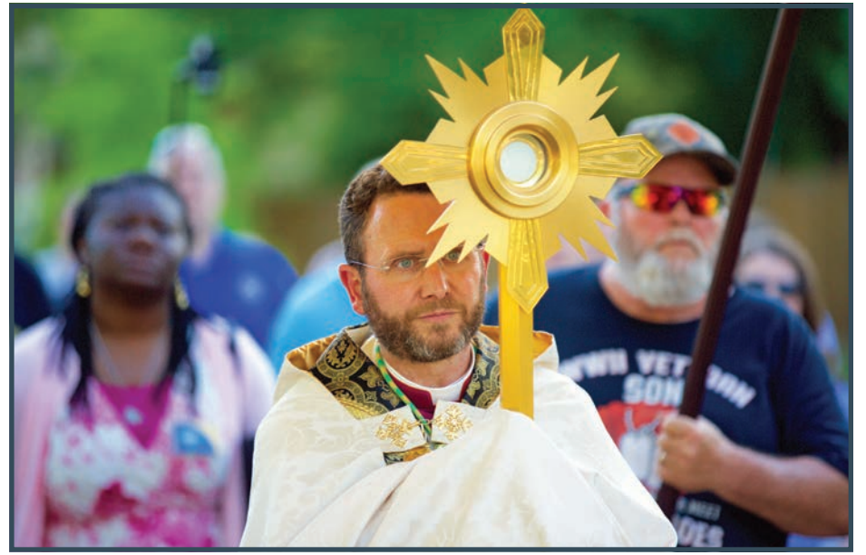
Auxiliary Bishop Andrew H. Cozzens of the Archdiocese of St. Paul and Minneapolis in Minnesota carries the Blessed Sacrament in a monstrance during a eucharistic procession on June 19. Bishop Cozzens is leading the planning of a national eucharistic revival for the U.S. Conference of Catholic Bishops.

"One of the great goals and desires of the National Eucharistic Revival is to commission 100,000 Eucharistic