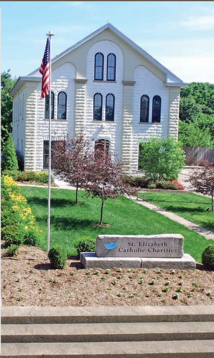
Photo above: Shown here is the headquarters of St. Elizabeth Catholic Charities in New Albany. On Feb. 1, the agency launched a transitional shelter and rapid rehousing program for victims of domestic violence once their immediate danger has passed.