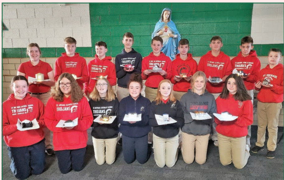
Above, eighth-grade students at St. Michael School in Brookville pose on Jan. 26 in the Batesville Deanery school with model houses that they created in their technology class through computer-aided design and a 3D printer. The models also include LED lights that the students learned how to use in the project.