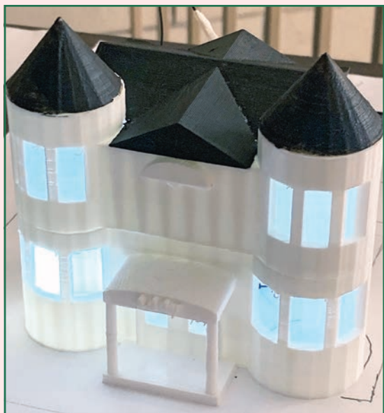
Left, this is an up-close image of a model house created by an eighth-grade student at St. Michael School in Brookville. It was made in the school's eighth-grade technology class in which students learn about computer-aided design, engineering, architecture and electrical work.