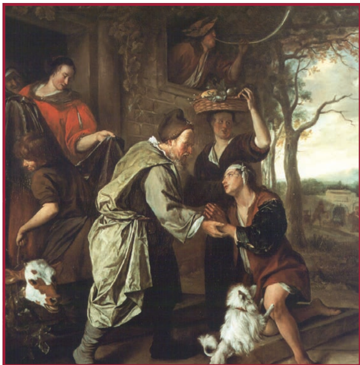
"The Return of the Prodigal Son" by 17th-century Dutch master Jan Steen is at the National Gallery of Art in Washington. The prodigal son said, "I no longer deserve to be called your son" (Lk 15:19). The same can be said of all humanity. Yet God in his mercy has made us his adopted children.