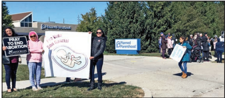
Members of St. Gabriel the Archangel Parish in Indianapolis promote respect for life outside the Planned Parenthood abortion facility in Indianapolis on Oct. 12, 2019.