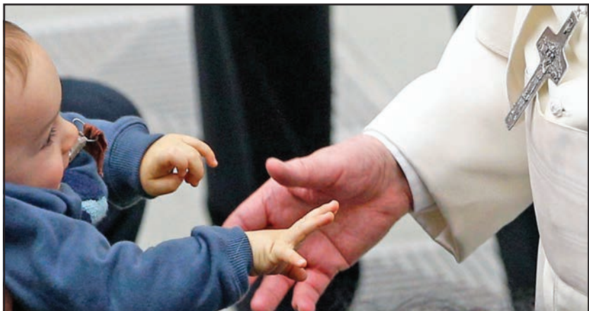
Pope Francis greets a baby during his general audience in the Paul VI hall at the Vatican on Jan. 12.