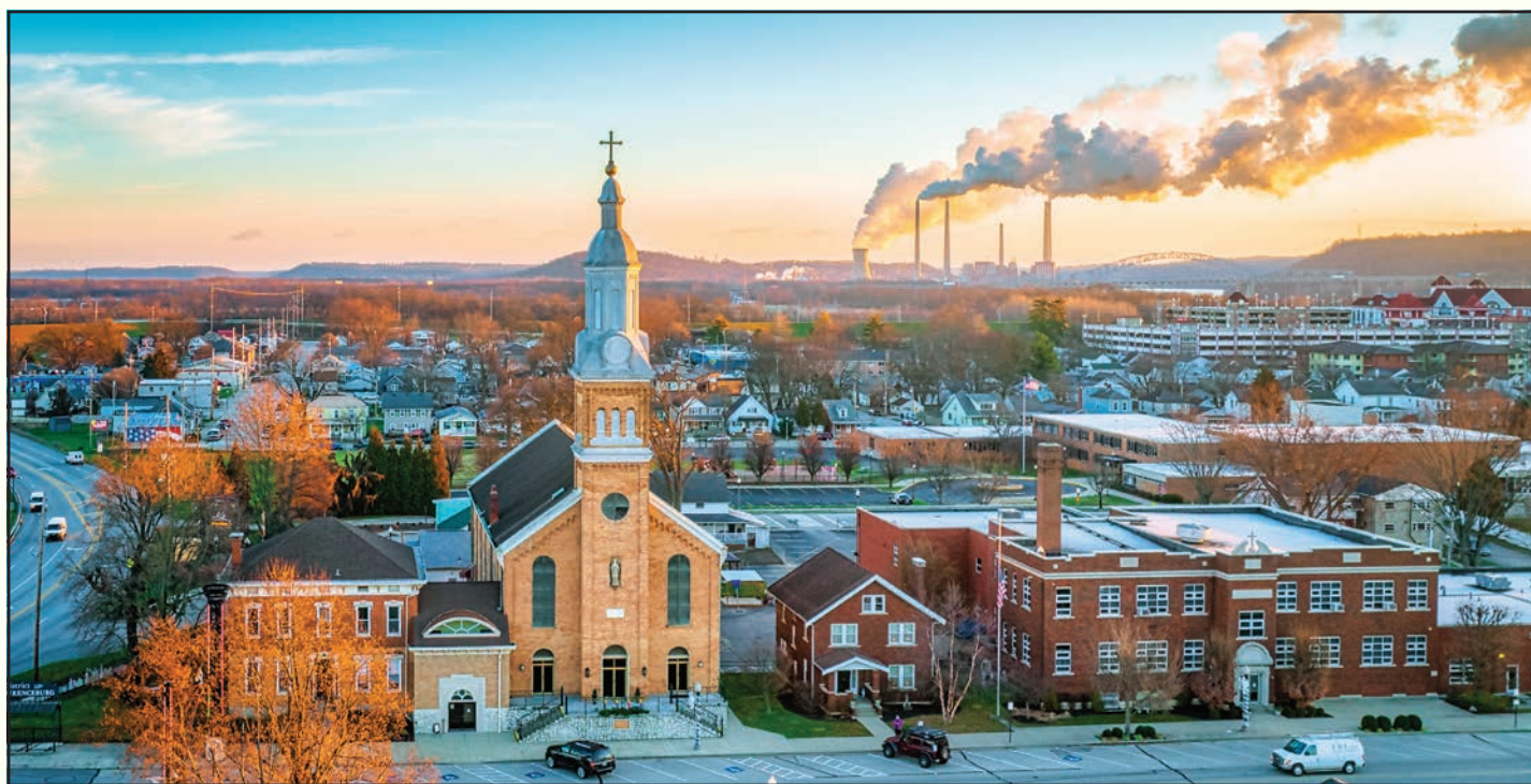
This aerial view portrays St. Lawrence Church and school in Lawrenceburg.

Being so close to the Ohio River, the parish church, built in 1867, has been affected by major floods in 1882, 1883, 1884, 1913 and 1937—when the water rose to a depth of 26 feet in the church. Fortunately, the church’s stained-glass windows, installed in 1899, have been spared.