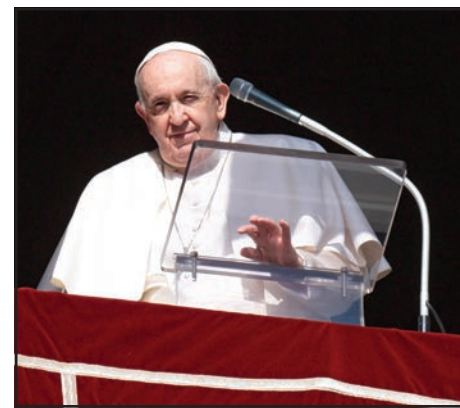
Pope Francis leads the Angelus from the window of his studio overlooking St. Peter's Square at the Vatican on Feb. 7. In his remarks, the pope encouraged people not to despair, but to invite Jesus into their lives.

It is precisely when one's "boat" is empty, "when we have nothing to offer him," that there is room for Jesus "to enter our voids and fill them with his presence," the pope said.