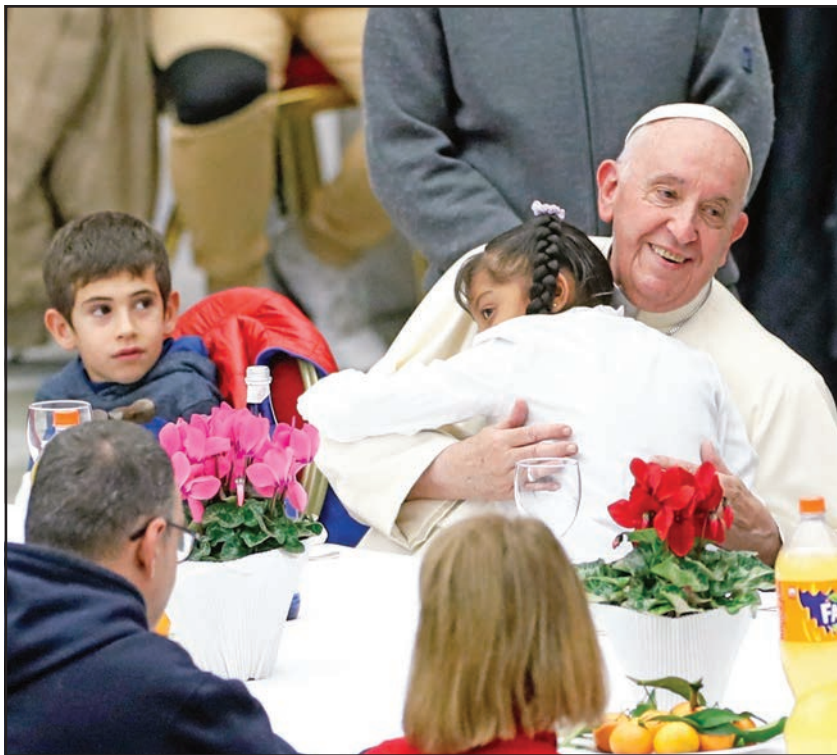
Pope Francis hugs a child during lunch in the Vatican audience hall on the World Day of the Poor on Nov. 13.