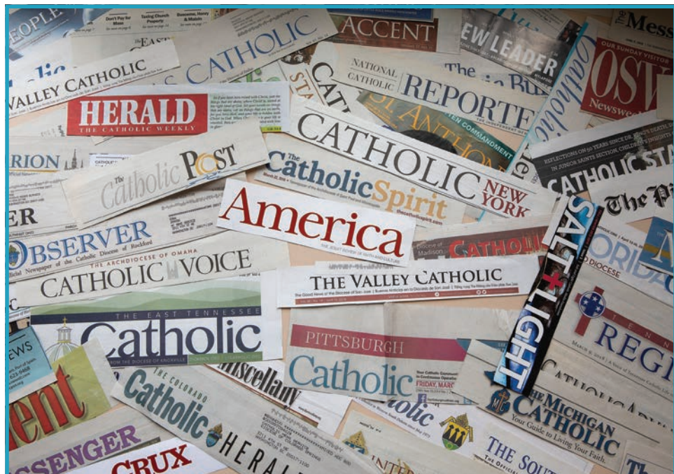
The mastheads of numerous Catholic newspapers are seen in this photo illustration. The Catholic press has and continues to play a vital role in strengthening the faith of its readers.