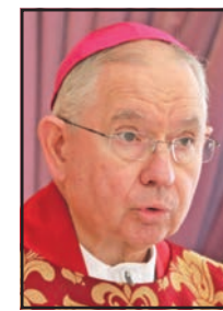
Archbishop José H. Gomez

BALTIMORE (CNS)—In a Mass on Nov. 14 to mark the opening of the 2022 fall general assembly of the U.S. Conference of Catholic Bishops