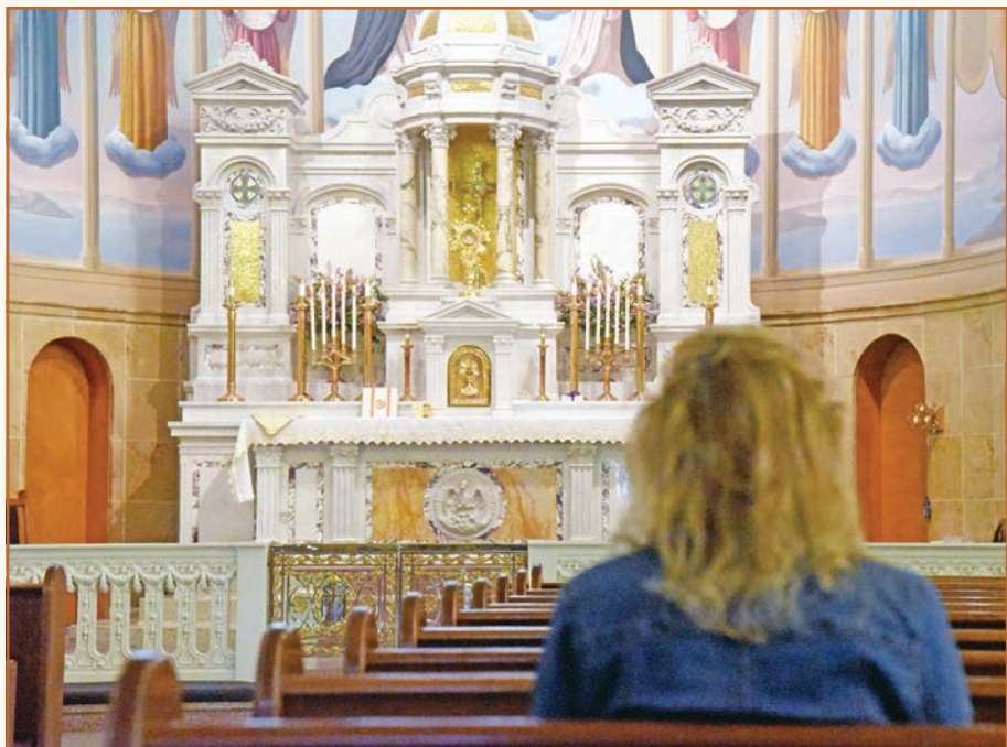
A woman prays in adoration before the Blessed Sacrament on Election Day, Nov. 8, in Our Lady of the Most Holy Rosary Church in Indianapolis. The parish had the Blessed Sacrament exposed for adoration while polls were open in Indiana.