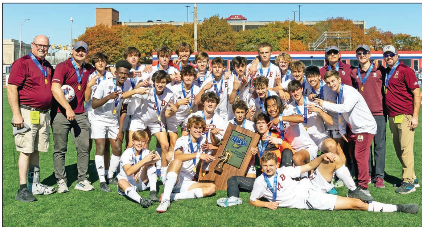
The boys' soccer team of Brebeuf Jesuit Preparatory School in Indianapolis celebrates winning the Class 2A state championship of the Indiana High School Athletic Association on Oct. 29 in Michael A. Carroll Track and Soccer Stadium in Indianapolis.

In the celebration that followed, the head coach watched in pure joy as teammates hugged each other, embraced their parents, raced to the stands to share the moment with their fellow students who had cheered them on, and posed for