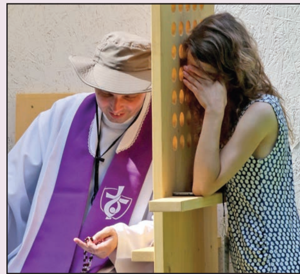
A priest hears confession from a World Youth Day pilgrim in 2016 at Park Jordana in Krakow, Poland.

Dec. 1, 6:30 p.m. at St. John Paul II, Sellersburg Dec. 6, 6:30 p.m. at St. Michael, Bradford Dec. 7, 6:30 p.m. at St. Michael, Charlestown (bilingual) Dec. 13, 6:30 p.m. at St. Francis Xavier, Henryville Dec. 14, 7 p.m. at Our Lady of Perpetual Help, New Albany Dec. 14, 7 p.m. at St. Mary, Navilleton Dec. 14, 7 p.m. at St. Mary of the Knobs, Floyd County Dec. 15, 6:30 p.m. at St. Anthony of Padua, Clarksville Dec. 19, 7 p.m. at St. John the Baptist, Starlight Dec. 20, 7 p.m. at St. Mary, Lanesville